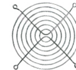
4" Fan Cover